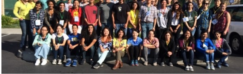
Environmental Health & Safety provides TANGO training to new teaching assistants and graduate students.