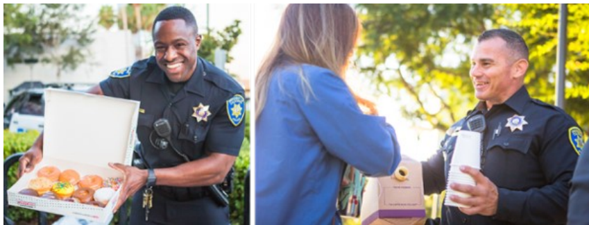
UCI police officers serving doughnuts and coffee to the UCI Health community.

Article provided by Environmental Health & Safety