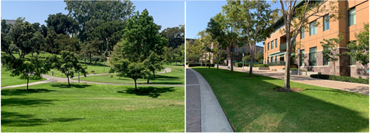
Some photos of the completed grounds maintenance areas during project: Aldrich Park (left) and Ring Mall (right).