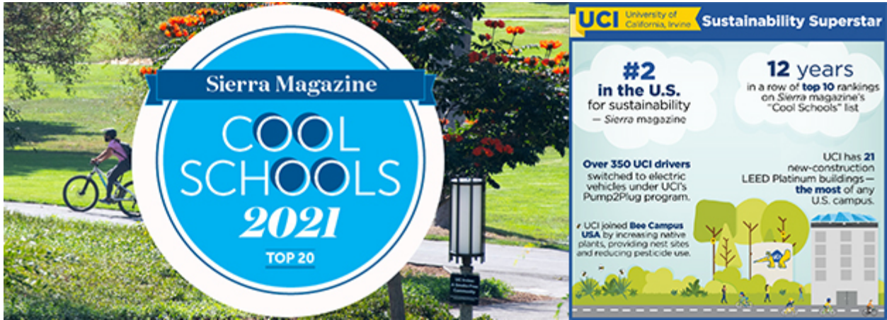
Sierra Magazine Cool School 2021 (left). Sustainability Superstar Infographic (right).