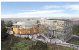
Anteater Learning Pavilion

To request a presentation or for more information about the program, please contact UCIPDsafes@uci.edu .