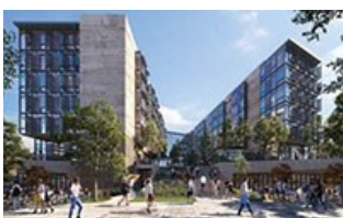
Middle Earth Housing

All new building projects will comply with UC Sustainability Policy and campus sustainability goals as well as targeting LEED Building Design and Construction – New Construction Platinum Certification.